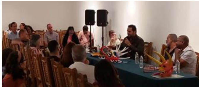
Artisan Workshops Maskmaking (Vejigantes)