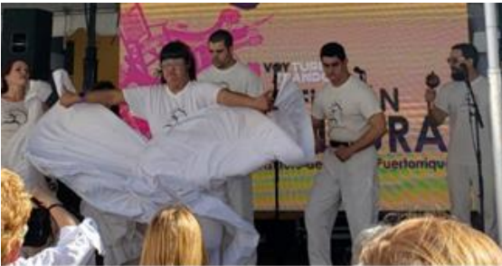
Bomba Dancing at Fiestón Cultural

The Fiestón Cultural offers the largest conglomeration of artisans (Folk Arts) in PR for four days in Cuartel de Ballajá in Old San Juan. Artisans (285) and fine arts professionals (110), including those from the School of Fine Arts and Design, showcase, sell their work, and offer workshops. The festival offers interactive arts activities and performing arts. It attracts participants (artisans) and public from the entire Island, as well as tourists. During the past years, it was celebrated simultaneously during Fiestas de la Calle San Sebastián. In 2020, due to the impact of the earthquakes, it was celebrated separately on February 28 – March 1, 2020. Celebrating the Fiestón separately allowed the project to receive sponsorships, which happened to be more successful. As a result, ICP will continue celebrating the Fiestón Cultural separately. The following link leads to a sample promotional poster and activities: Fieston Cultural Promotion . [SP: 1(1); 2(2); 5(2); 2(1); 2(2); 3(3); 5(1); 5(4); 6(3)]